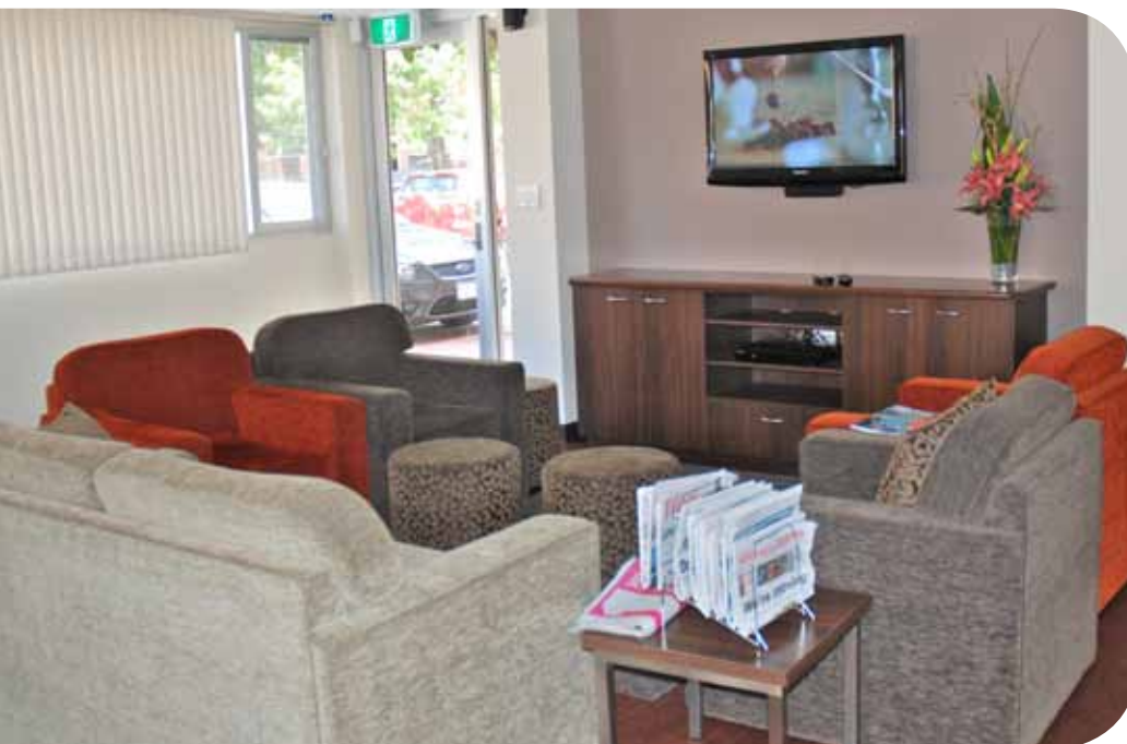
The renovated recreation room at Flinders Lodge.