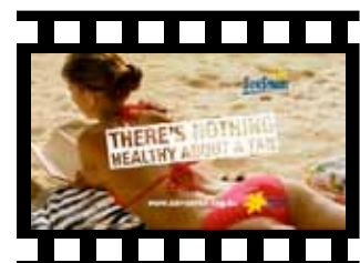
Images from the new Quit commercials and the 'Dark Side of Tanning' campaign