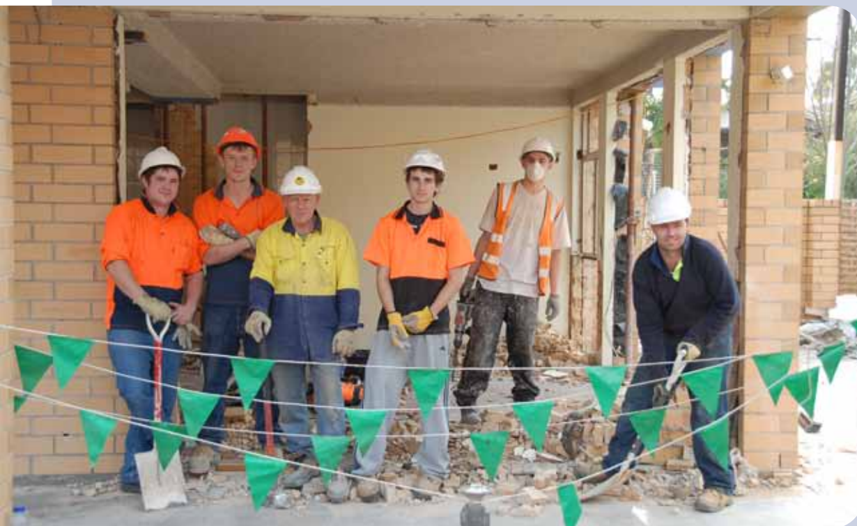
June 2010: the demolition of the old recreation room at Flinders Lodge.

In 2010 these funds were put to use in creating our new recreation room at Flinders Lodge, which has received rave reviews from guests. The room will make a world of difference—a welcome retreat and a place to rest and recover.