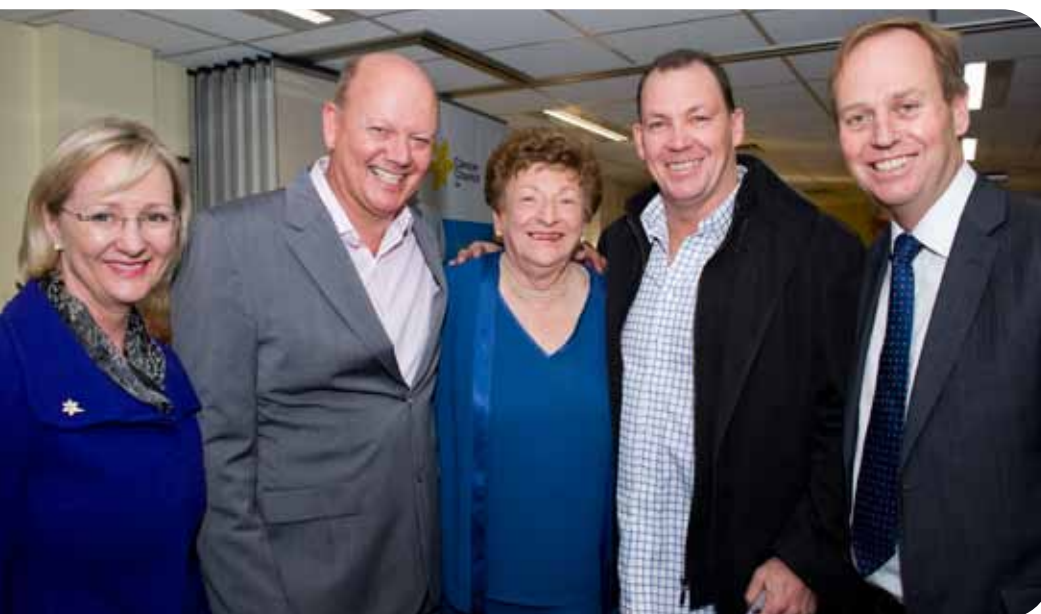
The passing of the baton—Majorie Jackson-Nelson passing the management of the Peter Nelson Leukaemia Research Fellowship Fund to Cancer Council SA